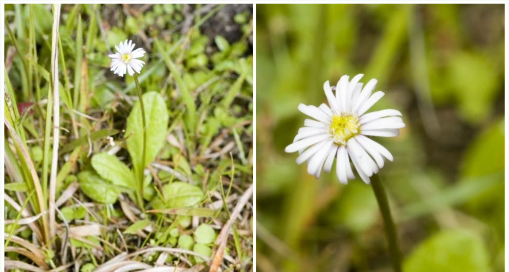
© M. Fagg, Australian National Botanic Gardens

Photographer: Fagg, M., 2007 'Lagenophora stipitata'