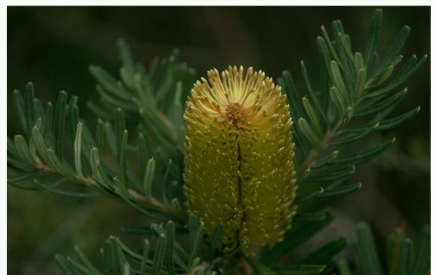
R. Hill © Australian National Botanic Gardens